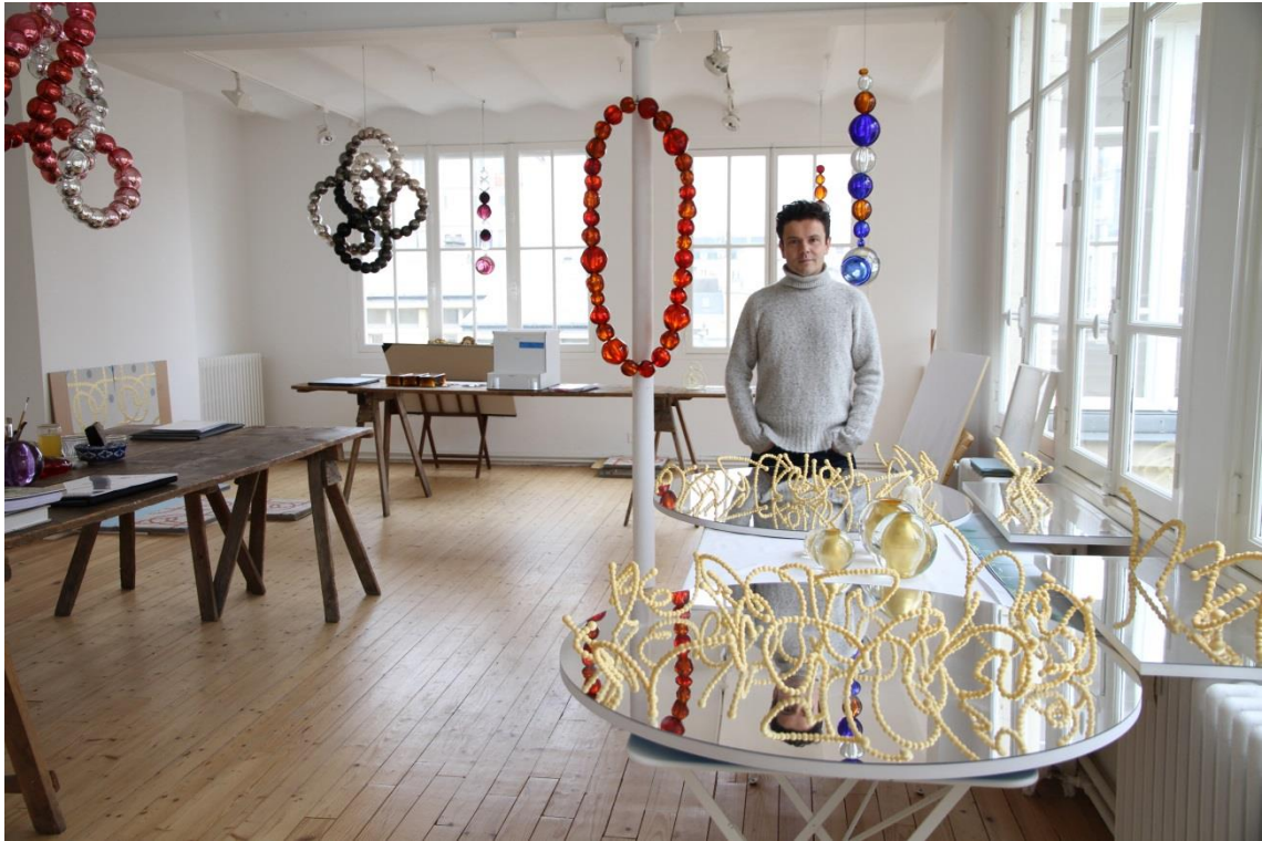
Jean-Michel Othoniel in his studio in Paris, 2014.

Jean-Michel Othoniel, a contemporary sculptor from France, has worked with a consistent theme of “metamorphoses” in materials, by using sulfur, wax and lead, materials with reversible properties.