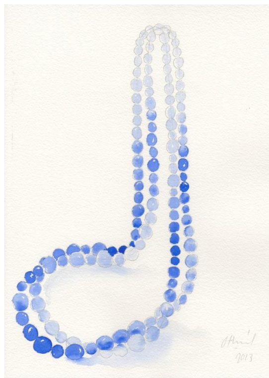
Untitled , 2014. Copyright Jean-Michel Othoniel/ADAGP, Paris, 2014

On the right is a drawing of the 2 lines necklace, which will be placed in the hallway of the 1 st floor of the museum. Each glass bead has its own shade of blue. This large necklace series has become representative of Jean-Michel Othoniel's work since the 2004 Louvre exhibition and the Peggy Guggenheim Collection, Italy in 2006.