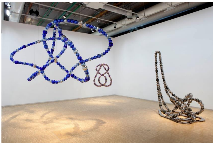
③ “My Way” exhibition view Centre Pompidou (Paris) 2011

Samsung Museum (Seoul) Hara Museum (Tokyo) Macau Museum (Macau) Brooklyn Museum (Brooklyn) Retrospective